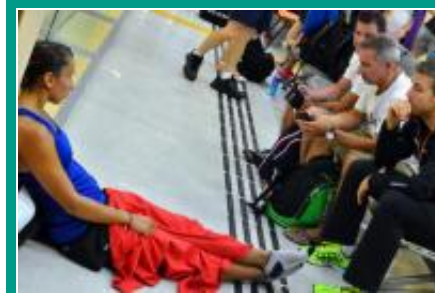
Relieved French contingent