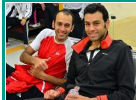
The Shorbagys are here