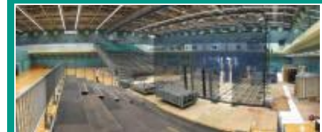
Glass court growing